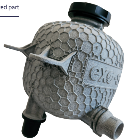
3D printed part

Exo-s considers additive manufacturing for the automotive industry as a new tool in their service portfolio. All manufacturing processes have intrinsic advantages and disadvantages. By using them in a complementary way, the company can achieve performances never seen before, primarily in terms of productivity and plastic parts geometry. The result is a win-win technology for customers, manufacturers and end users alike.